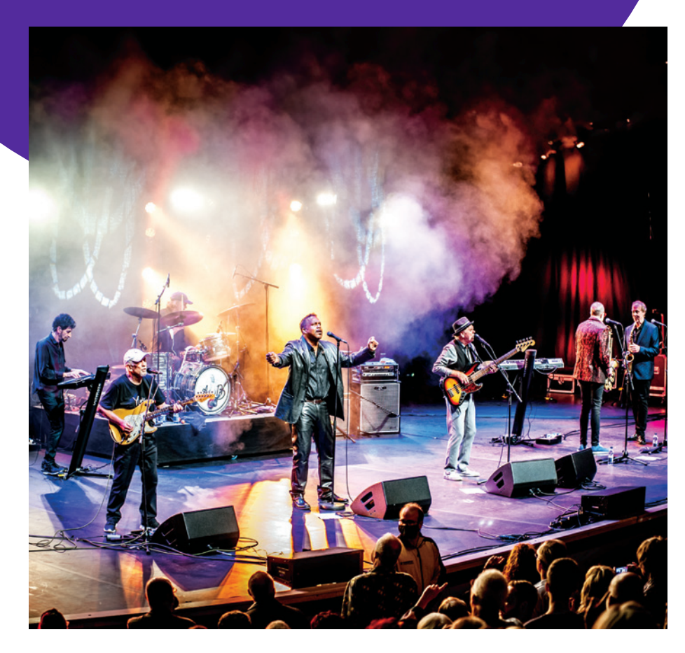
FRIDAY, NOVEMBER 22, 2024 | 7:30 P.M.

Regarded as one of the top soul, R&B, and jazz-funk groups, and first known for the timeless instrumental hit "Pick Up the Pieces," the band's future would lie in its diverse songwriting and unique approach to rhythm & blues. With multiple gold & platinum albums and three GRAMMY® nominations on the legendary Atlantic label, they were the first Brits to simultaneously top the US Top 100 Singles, Albums and R&B charts, before going on to similar UK and international honors.