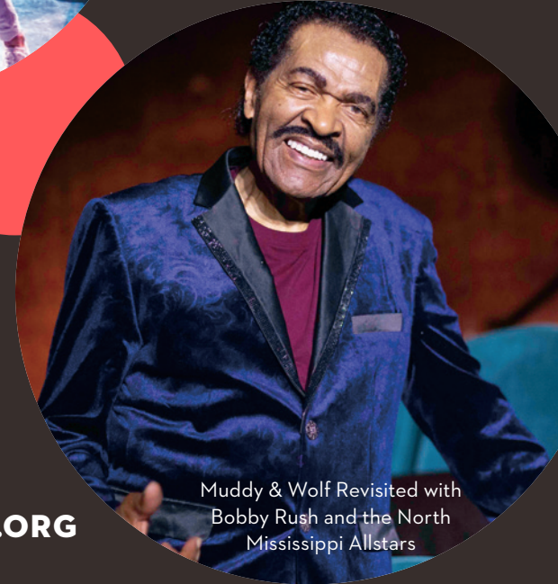
Muddy & Wolf Revisited with Bobby Rush and the North Mississippi Allstars