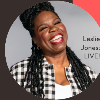
Leslie Jones: LIVE!

Literature To Life: The Great Gatsby 2/1/25