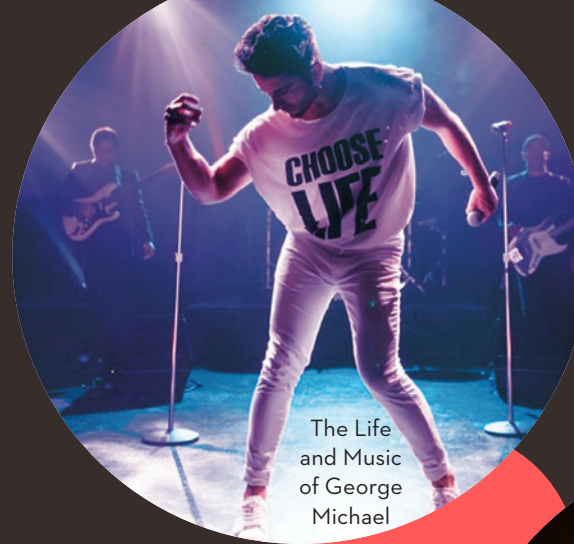
The Life and Music of George Michael