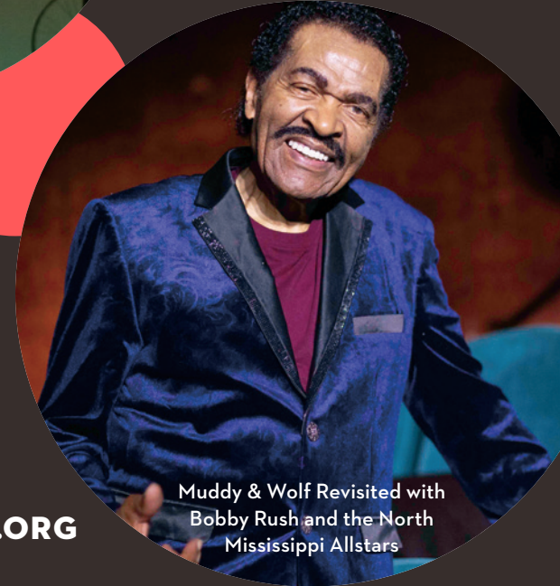
Muddy & Wolf Revisited with Bobby Rush and the North Mississippi Allstars