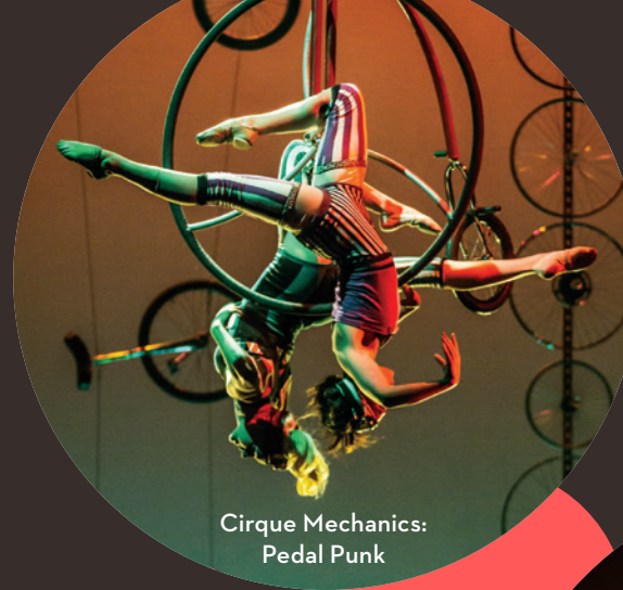
Cirque Mechanics: Pedal Punk