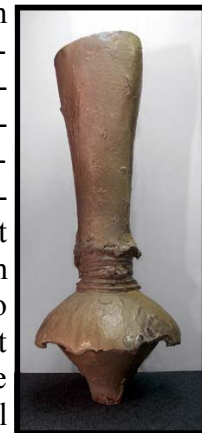
Skirted Vessel #7